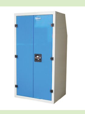
ARM/9635 507mm x 966mm x 353mm