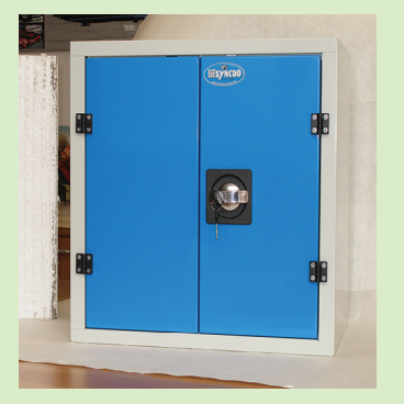
ARM/4835 507mm x 483mm x 353mm