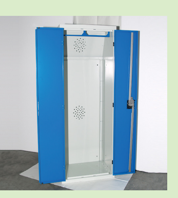
ARM/7235 507mm x 724mm x 353mm