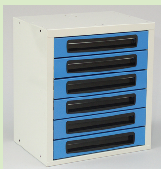
Flush handle at the front