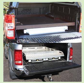
Aluminium or grip deck top