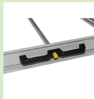
Push bottom automatic locking system