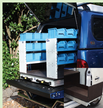
Suited to utility vehicles Suited to rear and side of vans