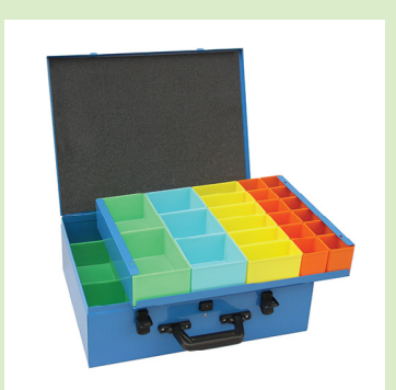
Elite 130 440mm W x 130mm H x 330mm D