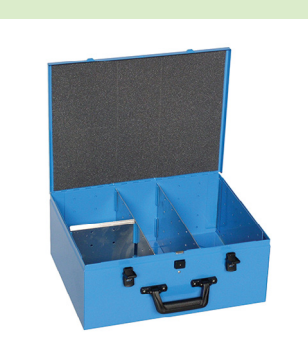
Elite 173 440mm W x 173mm H x 330mm D