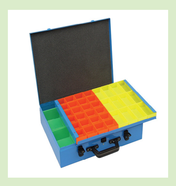
Elite 100 440mm W x 100mm H x 330mm D