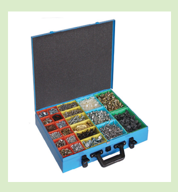
Elite 66 440mm W x 66mm H x 330mm D