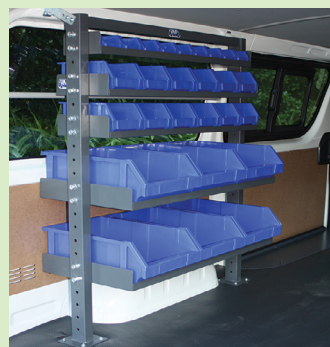
Professional look and design