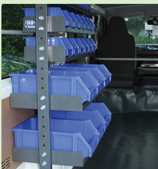
Suited to fit SWB and LWB vans