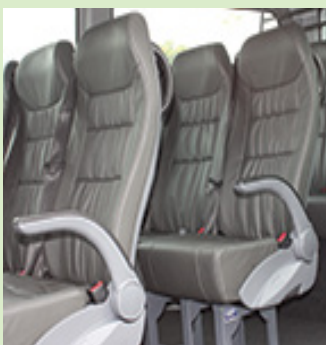
Comfortable leather seat covering