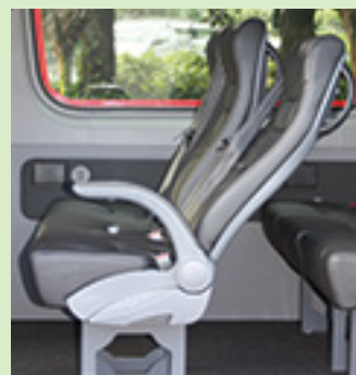
Reclining back rests and folding armrests