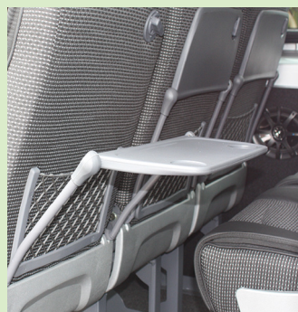
Tray table and magazine net