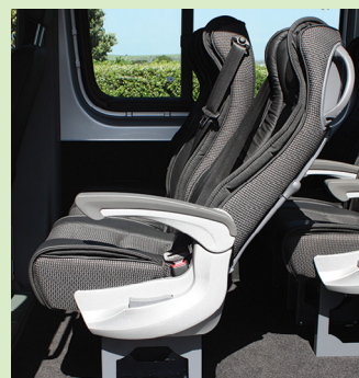
Reclining back rests and folding armrests