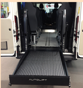
Anti-slip mesh platform