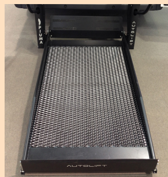
Full load platform