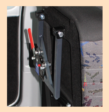
Quick release leg