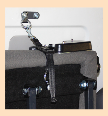
Clip support at top