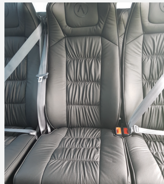
Extra comfort, high bucket seating