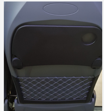
Magazine net for storage