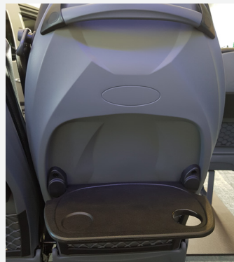
Convenient fold away tray & cup holder