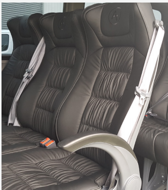
Folding arms and reclining backrests